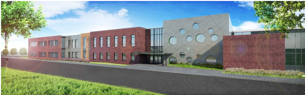
James L. McGuire Elementary School