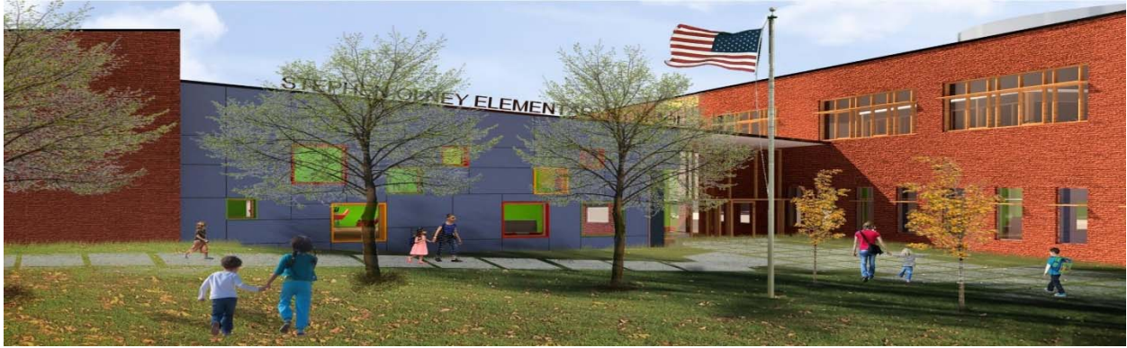
Stephen Olney Elementary School