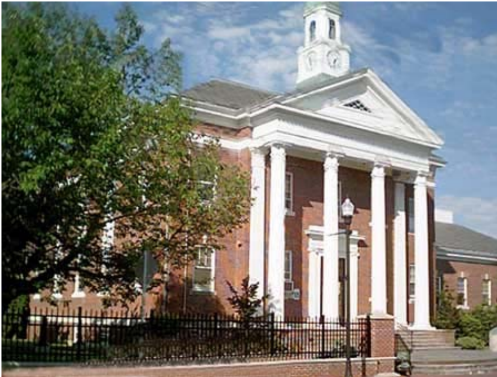
Frank C. Angell Memorial Town Hall