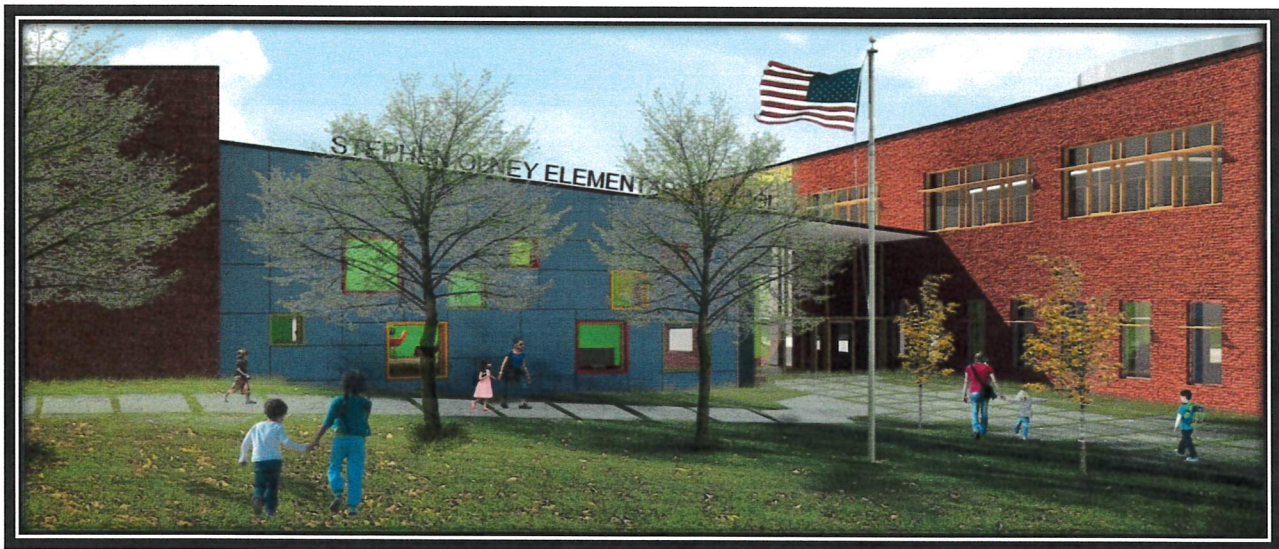
Stephen Olney Elementary School