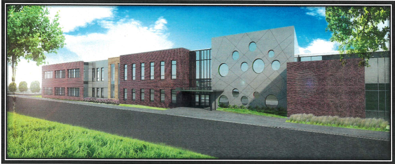
James L. McGuire Elementary School