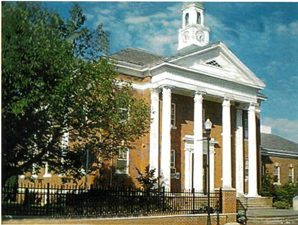
Frank C. Angell Memorial Town Hall